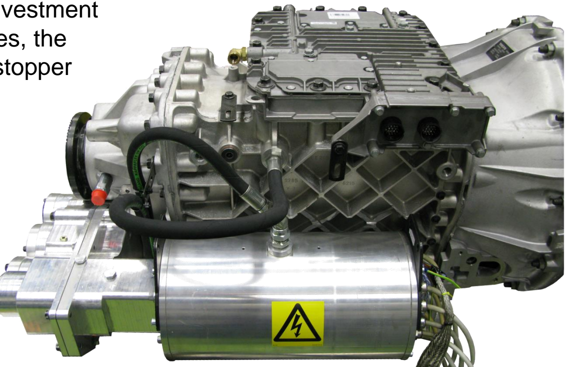
Figure 1 The prototype machine mounted on the side of a Volvo AMT gearbox for heavy vehicle applications