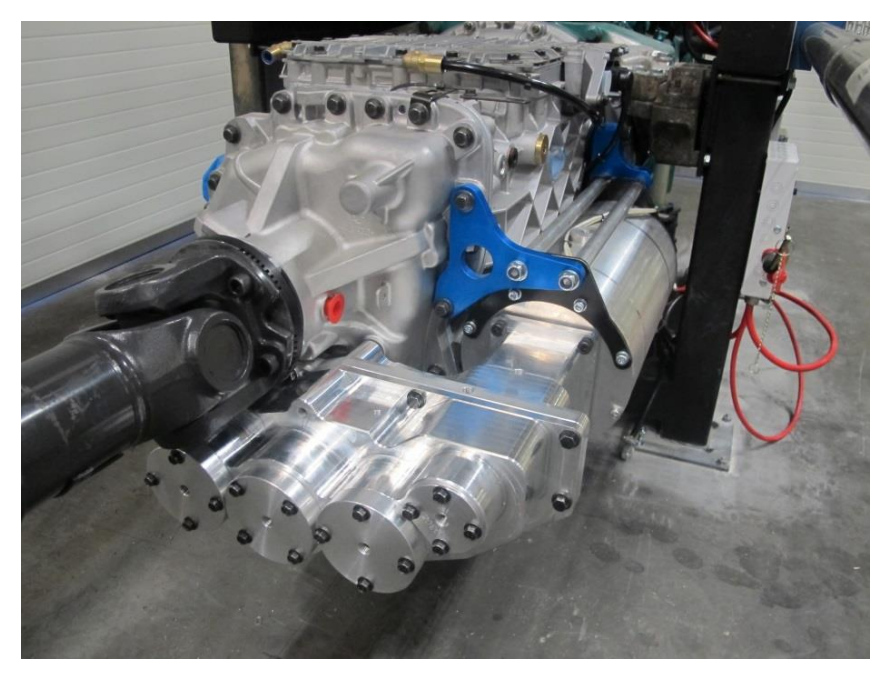
Figure 4 The prototype installed at the test facility at Sibbhultsverken AB